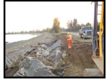
Damian Girard observing the rip-rap placement