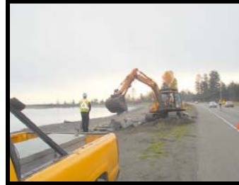
Placing the filter cloth

Tracy Cooper, MoT, toured the area and agreed that the funding should be provided to complete the project.