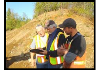
The assessment is discussed with the operator.

The assessment includes the operators ability in ditching , loading rock, placing rock, using the machine on in-clines, loading and unloading the machine.