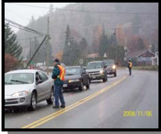
Montrose, BC—ICBC & Emcon Services “Safe Winter Driving Campaign”

Emcon Services Inc., in conjunction with the Ministry of Transportation and Infrastructure, and ICBC held a “Safe Winter Driving Campaign” at Montrose on Highway 3b on November 6th, 2008.